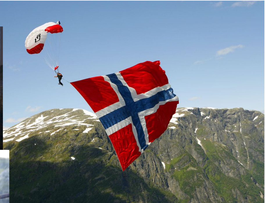
Nils-Erik Bjørholt/Innovation Norway